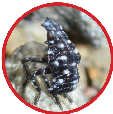
Early nymphs (April-July)