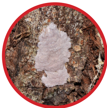
Egg masses (Sept.-June)

WE NEED YOUR HELP TO STOP IT BEFORE IT BECOMES ESTABLISHED