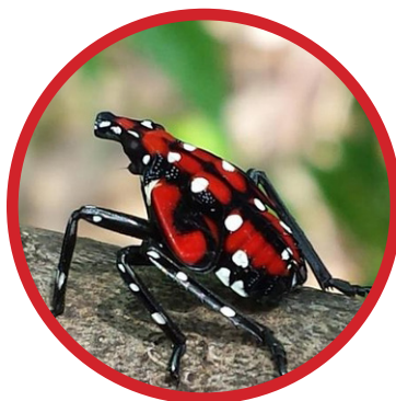
Late nymphs (July-Sept.)