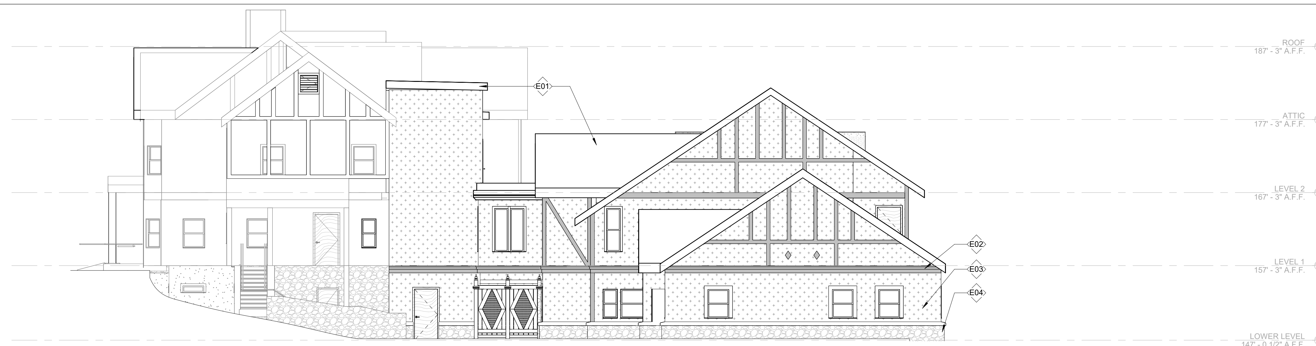
EAST ELEVATION A4 REF DRAWING: A1 / A400 SCALE: 1/8" = 1'-0"