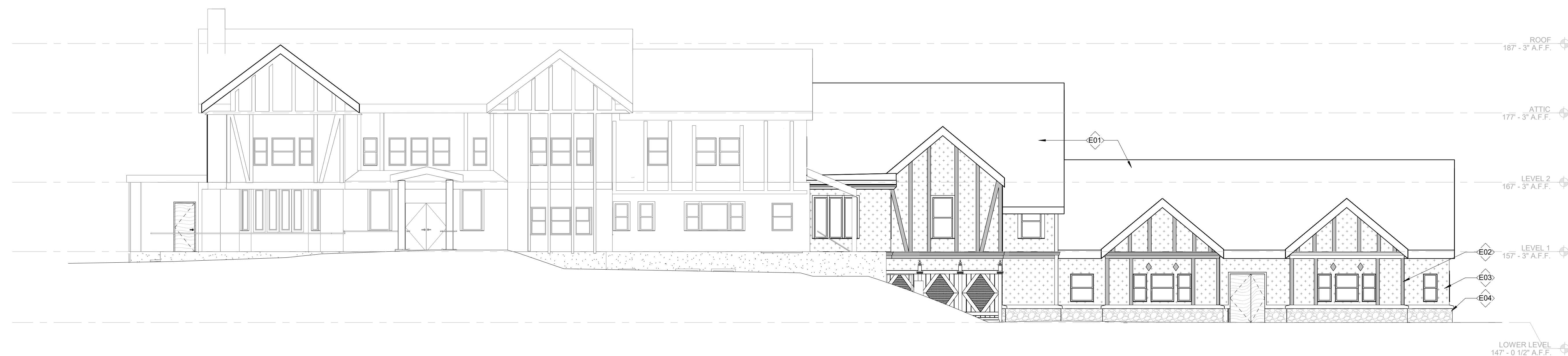
SOUTH ELEVATION A1 REF DRAWING: A1 / A400 SCALE: 1/8" = 1'-0"