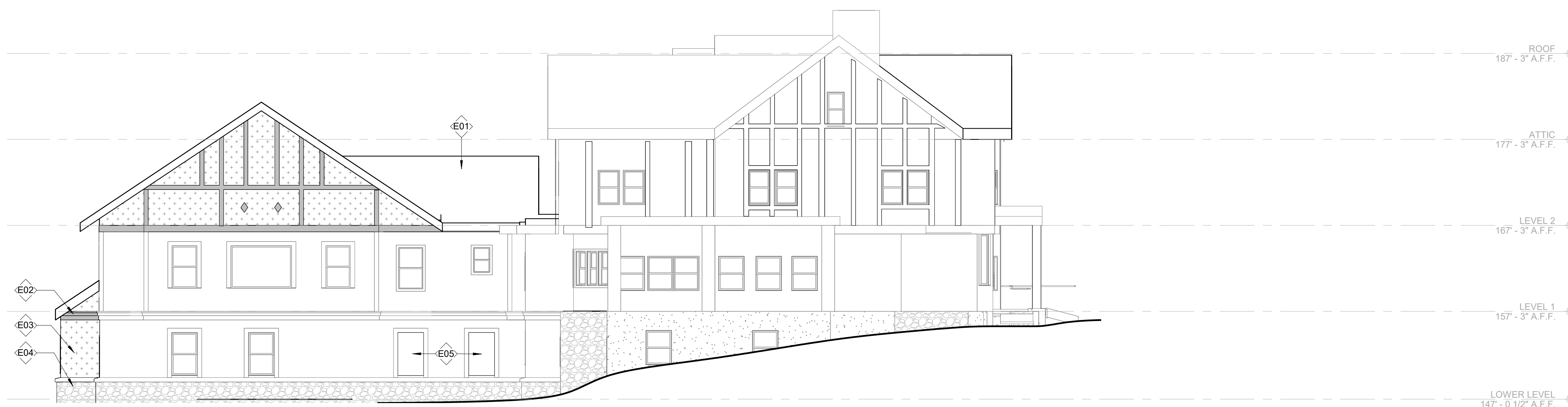
WEST ELEVATION A3 REF DRAWING: A1 / A400 SCALE: 1/8" = 1'-0"