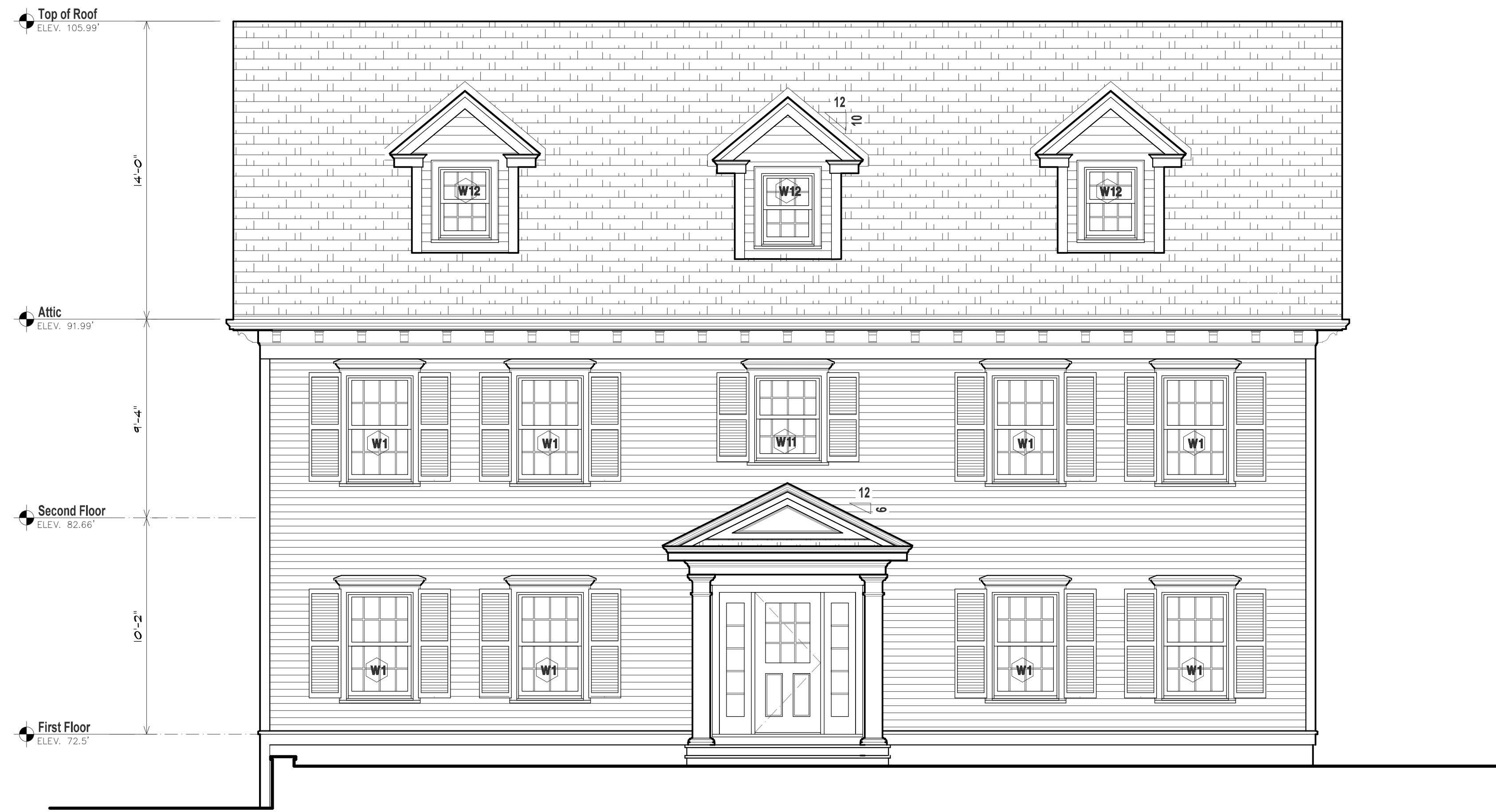
1 FRONT ELEVATION A2.1 1/4" = 1'-0"