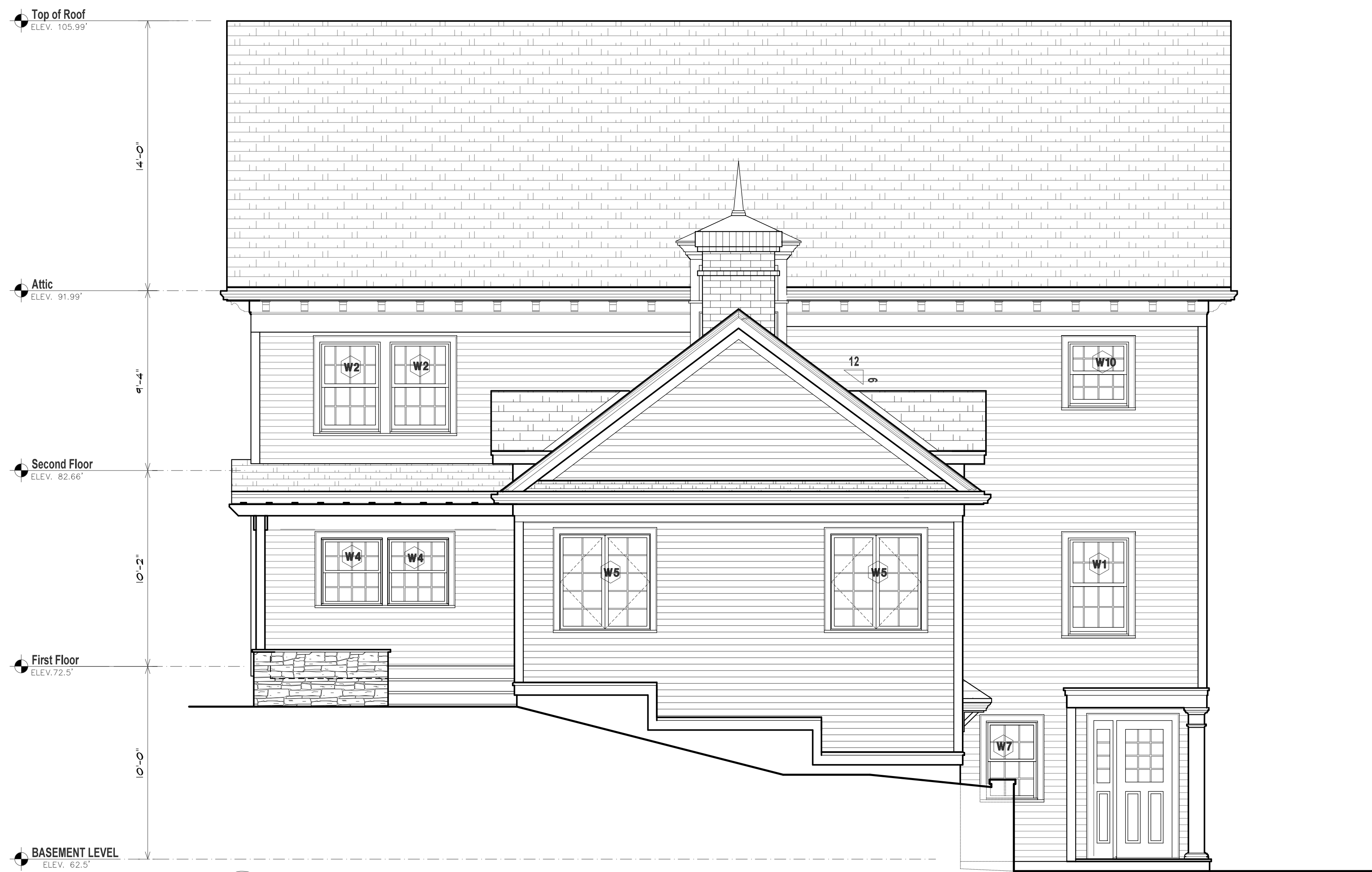
2 REAR ELEVATION A2.1 1/4" = 1'-0"